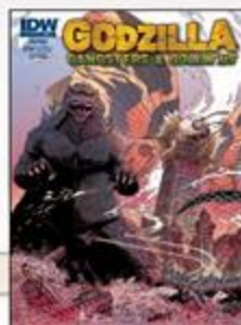
Cover A art by James Stokoe