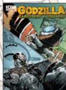
Cover B art by Alberto Ponticelli colors by Jay Fotos