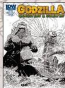
Incentive Cover art by James Stokoe